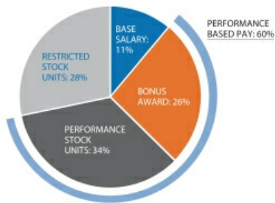
COMPONENTS OF COMPENSATION PROGRAM CEO MIX