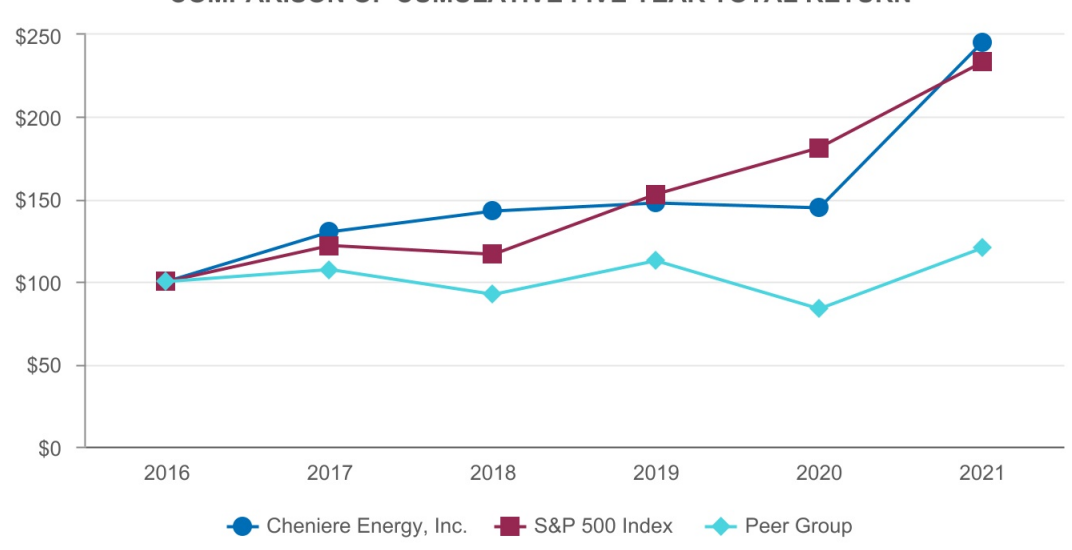
ITEM 6. [Reserved]